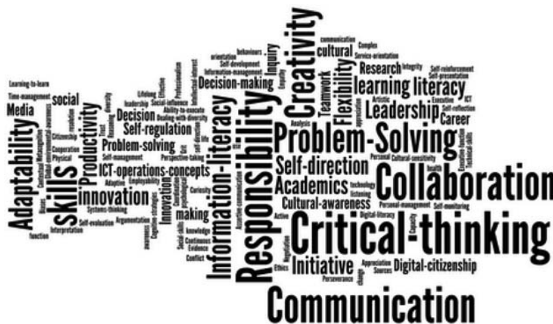
Figure 6. Word cloud with more than 80skills and key competences created by Participant 1

In general, interactions reverberated the co-inquiry that was assumed by participants and their study plans. Constant constructive feedback, initially offered to projects by the mediator in charge of the online environments, was evidenced among all participants in the group, who naturally found convergent points among their research projects.