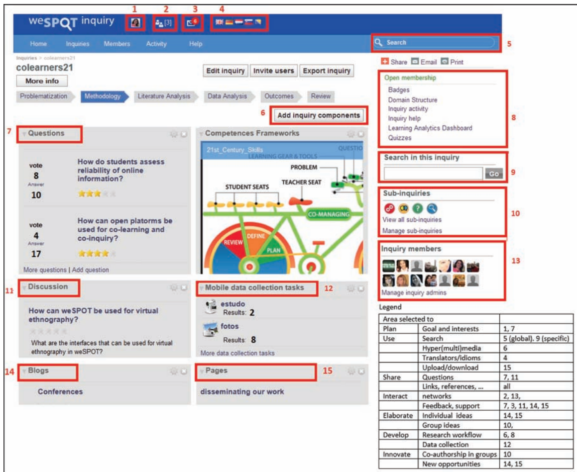
Figure 3: weSPOT environment

information in a wiki, presented by inquiry, theme and chronological order. They were able to follow relevant messages through notifications and provide feedback in both environments. They were able to embed images, graphics and videoclips in both platforms. It was possible to notice that some participants used open content searching interfaces, translators for multilingual forum and other applications to create visualisation and maps.